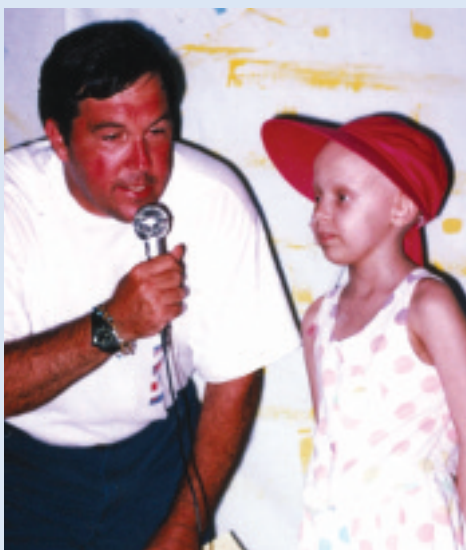
Hamilton Jordan 1944 ~ 2008