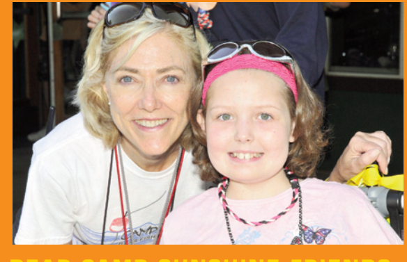
DEAR CAMP SUNSHINE FRIENDS

Childhood cancer respects no geographic boundaries. That is why Camp Sunshine offers programs throughout the state. From the coastal low country to the north Georgia mountains and many points in between, Camp Sunshine provides opportunities for children with cancer and their families to connect with others facing similar challenges. A day at the ballpark or a cultural outing gives families a chance to relax, make friends, rediscover one another and have fun.